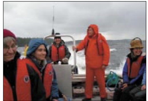
Symposium participants head to workshop.

In April, 22 members attended three days of training workshops at the Bamfield Marine Science Centre for the 2007 Third Annual Eelgrass Symposium. We spent time both on the shores practicing mapping