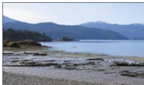
Debris at Bish Cove.

At present, the bed is littered with wood debris as well as plastics and rubber (see photo). We hope that if the LNG project proceeds, funds will be set aside to clean up the bed of the debris.