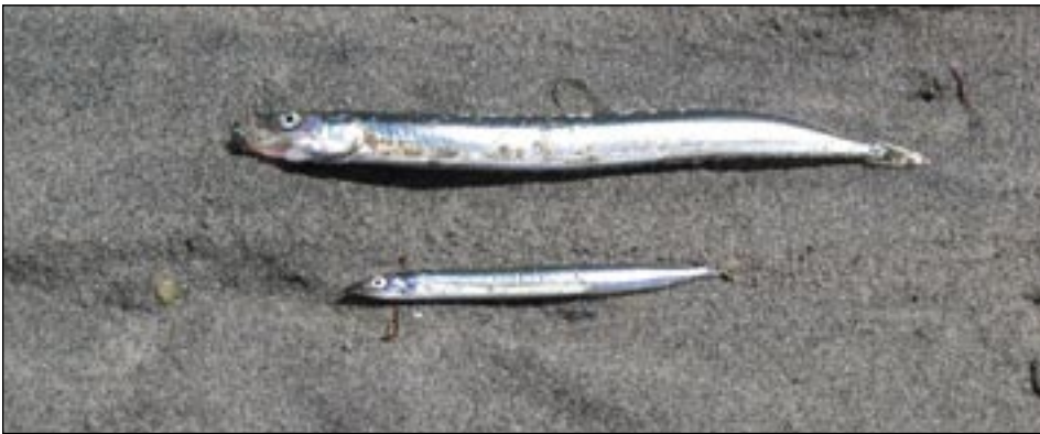
Sandlance on Qualicum Beaches.