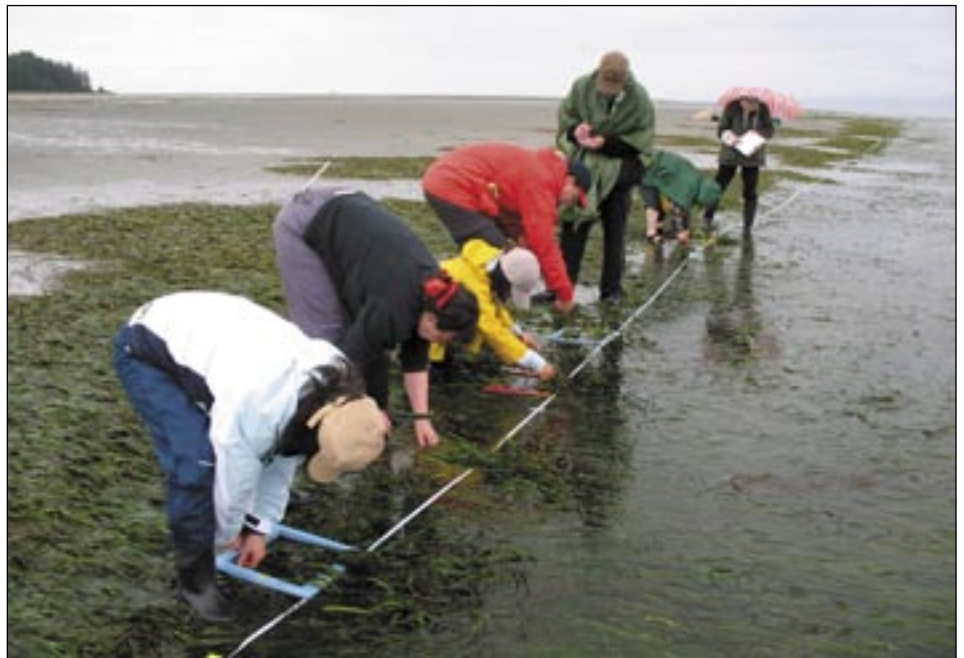
Geocachers map at Rathtrevor Provincial Park.

• The research shows that stewardship is different from other volunteering in that the quality of the social experience and the teamwork is key, vs. other volunteer work in hospitals for example. Stewards want to feel part of a community of individuals.