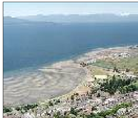
Aerial view of Parksville Bay.

Based on information collected at this initial presentation, subsequent