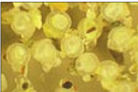
Sandlance eggs.

Several funders including Pacific Salmon Foundation, Vancouver Foundation, Shell Environmental Fund, Mountain Equipment Co-op and others