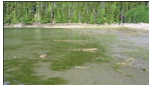
Bish Cove eelgrass.

hoped there will be little disturbance to the beds overall. Potential impacts could occur when the dock itself is under construction. Later when 100' tugs are moving ships, the prop wash may increase the turbidity or movement of the sand itself, causing a loss of eelgrass.