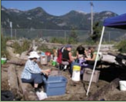
Volunteers were eager to be a part of the action in Squamish as seen in this photo on a great sunny day in the presence of those majestic peaks. I guess someone has to do it...