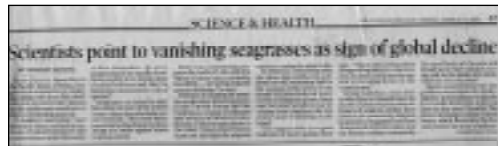
Headlines indicate significance.

If you would like to view a summary of the proceedings, please check the SCWG web site: www.stewardshipcentre.bc.ca/eelgrass/index.html