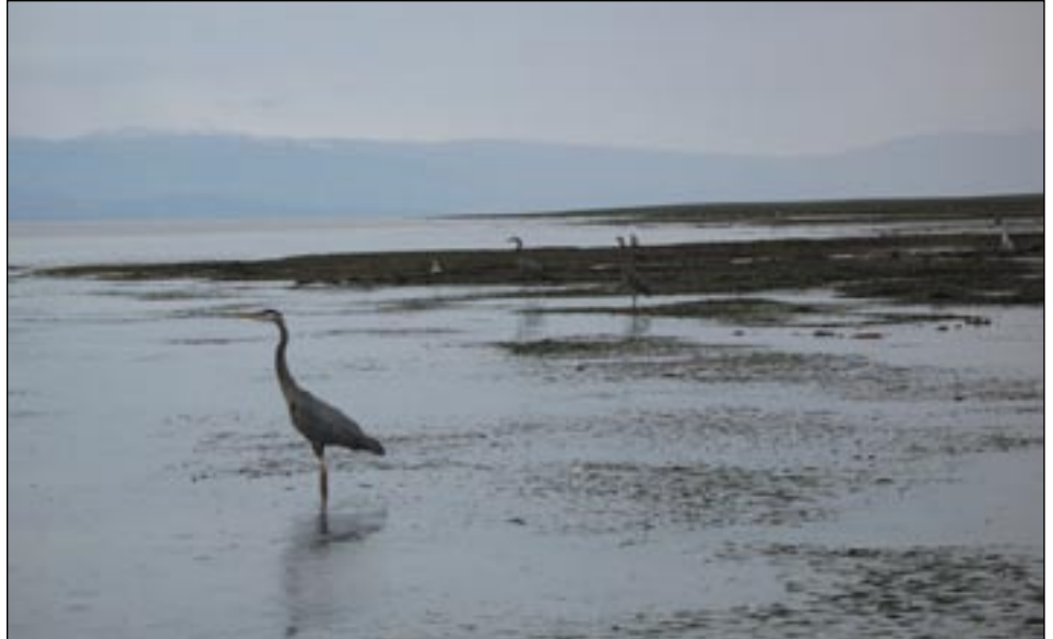
Great Blue Herons feed in Parksville eelgrass.

Support for this volunteer group will be ongoing via website and video on our website. Success of the project will be measured by expansion of eelgrass